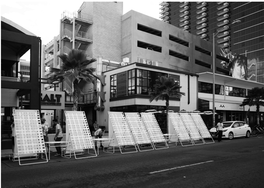
Figure 1. Lawn Loungers at Parking Day 2019 in Honolulu's Kaka'ako neighborhood. Sierralta and Strawn.

these conversations informed the development of a community engagement process, a design framework, and a digital/physical research platform to be utilized by the local public housing authority in the planning of future projects. The everyday lawn chair serves as the design inspiration for this project. Lawn Loungers are familiar and approachable, humble and playful, welcoming and comfortable. They are composed of aluminum frames and woven surfaces. They serve as hangers for waterproof posters, as tables for co-creation exercises, and as chairs for chatting and relaxing. Collectively, these portable architectural artifacts frame communal spaces that allow guests to slow down and interact with one another while sharing their thoughts on the future of housing in Hawai'i.